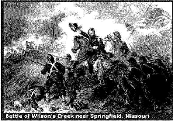
Battle of Wilson's Creek near Springfield, Missouri