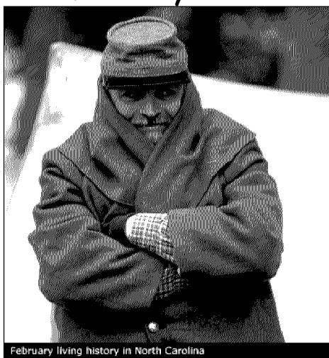
February living history in North Carolina